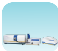
Laser Particle Size Analyzer