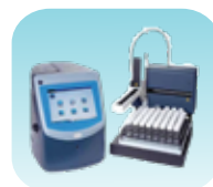
Total Organic Carbon 3800