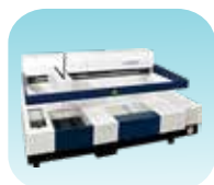
Fully Automated CLIA