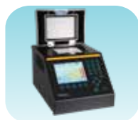
PCR/Gradient PCR/ RTPCR