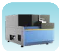
Optical Emission Spectrophotometer